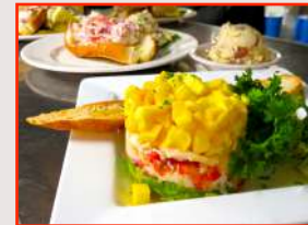
Lobster Avocado Cocktail

With any business, efficiency and cost control are critical to success. The Lobster & Chowder House guides your franchise with an outstanding training program and effective tools for managing your business.