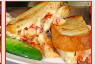
Lobster Grilled Cheese