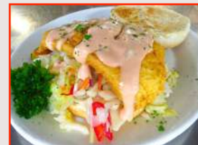
Cod Fish Reuben

From Real Estate Assistance to Marketing support, The Lobster & Chowder House is here to back your franchise every step of the way. Our goal is to help you create a solid foundation for success and use our years of experience to help you grow.