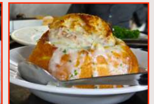
Chowder Bread Bowl